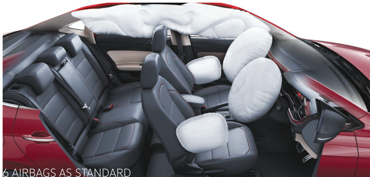
6 AIRBAGS AS STANDARD