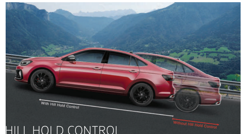
HILL HOLD CONTROL