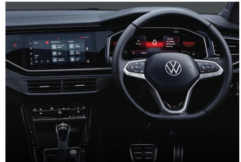
DUAL TONE DASHBOARD