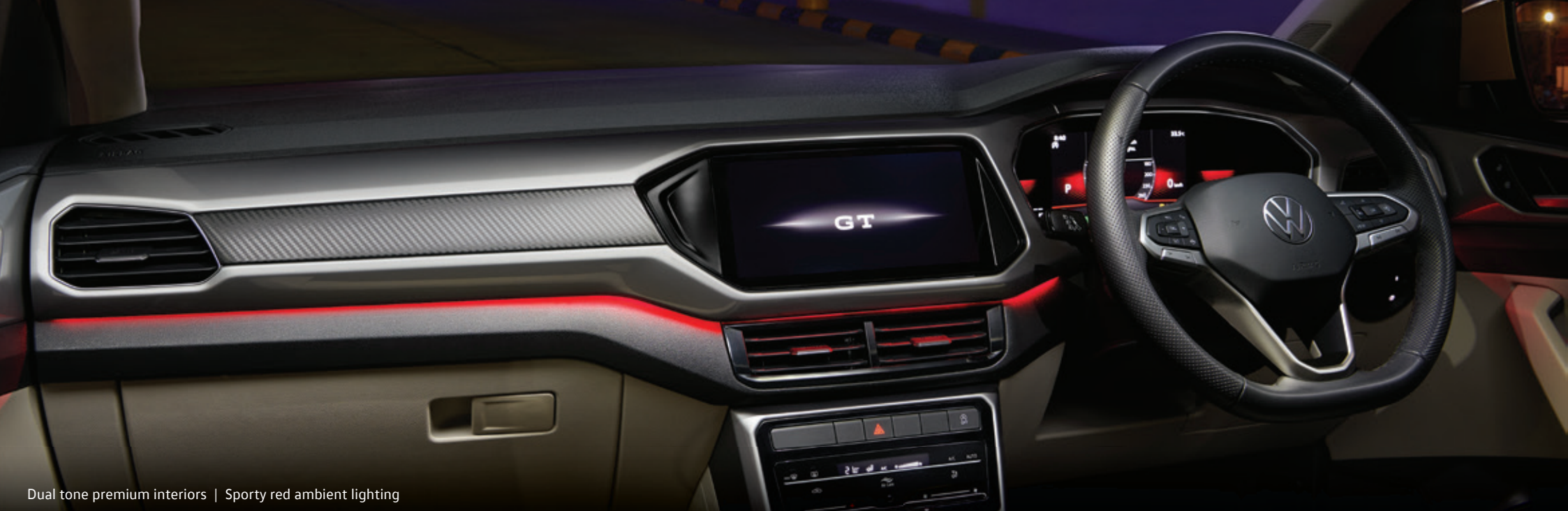
Dual tone premium interiors | Sporty red ambient lighting