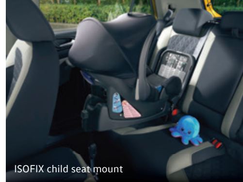
ISOFIX child seat mount