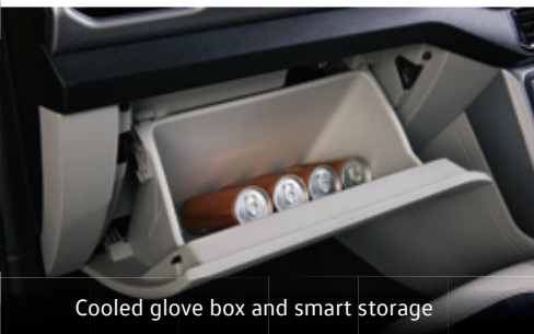
Cooled glove box and smart storage

The intuitive and thoughtful Taigun helps you play smart to stay ahead in the hustle. The Volkswagen signature flat bottom multi-function steering wheel allows you stay on top of all that drives you ahead. While the smart touch Climatronic AC and the ventilated seats set the temperature and keep you comfortable in any condition.