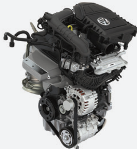
1.0L TSI engine 115 PS (85 kW) @ 5000 – 5500 RPM 178 Nm @ 1750 – 4500 RPM