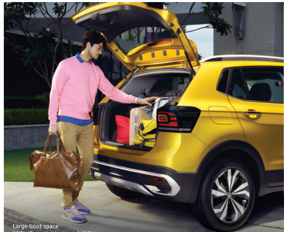
Large boot space 385L (Extendable up to 1405L)

Once inside, the Taigun sets the mood for your hustle, with its sporty ambient lighting. The dual tone premium interiors are designed by and for those with an eye for detail. The carbon finish complements the sporty look, while the massive boot space lets you accommodate a lot more in your everyday hustle.