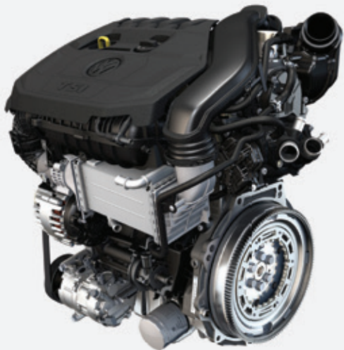
1.5L TSI EVO engine 150 PS (110 kW) @ 5000 – 6000 RPM 250 Nm @ 1600 – 3500 RPM