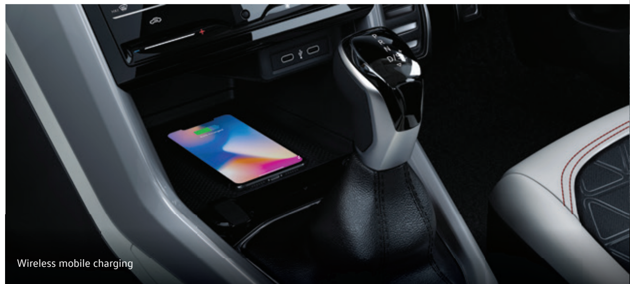
Wireless mobile charging