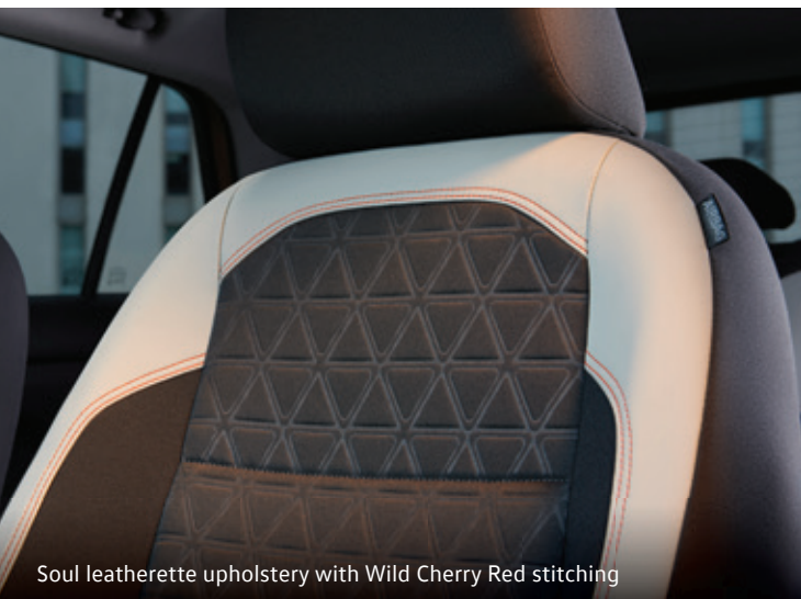
Soul leatherette upholstery with Wild Cherry Red stitching

Once inside, the Taigun sets the mood for your hustle, with its sporty ambient lighting. The dual tone premium interiors are designed by and for those with an eye for detail. The carbon finish complements the sporty look, while the massive boot space lets you accommodate a lot more in your everyday hustle.