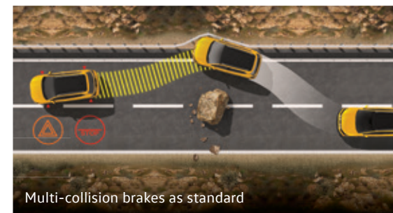
Multi-collision brakes as standard