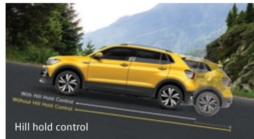
Hill hold control