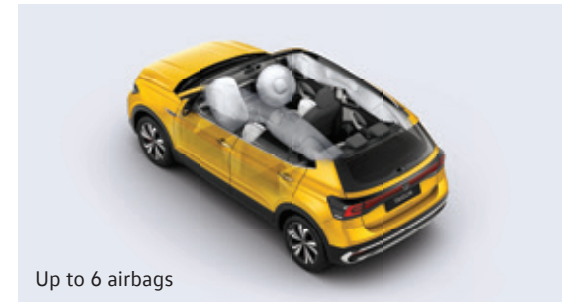
Up to 6 airbags