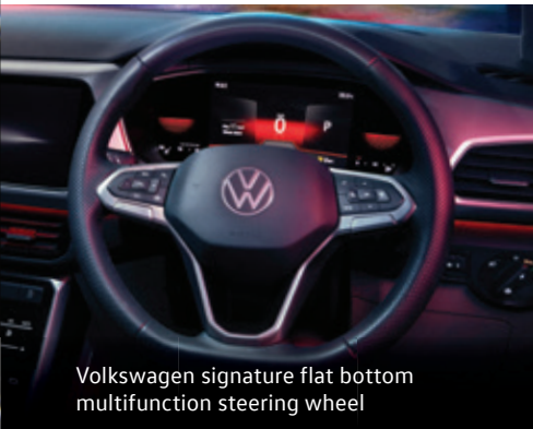
Volkswagen signature flat bottom multifunction steering wheel