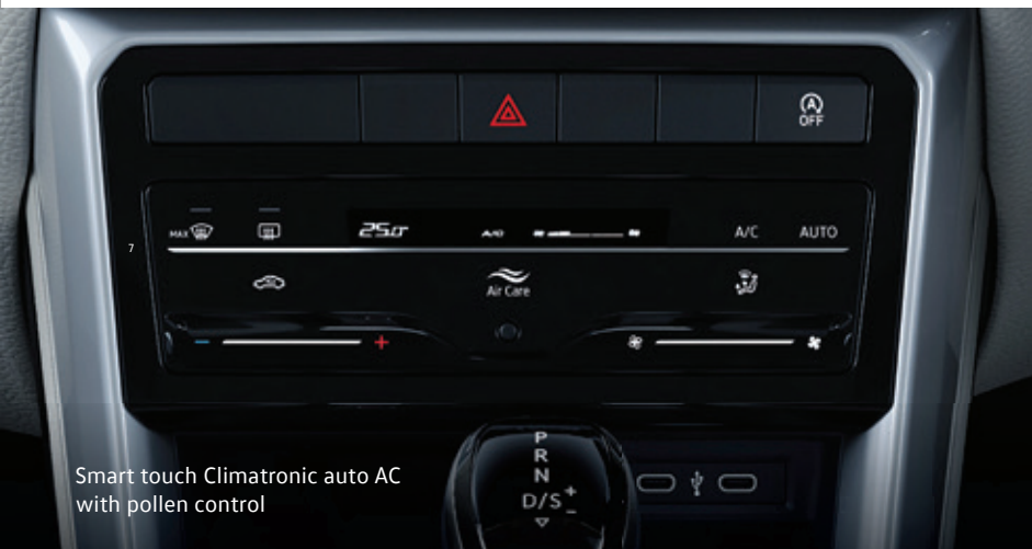
Smart touch Climatronic auto AC with pollen control