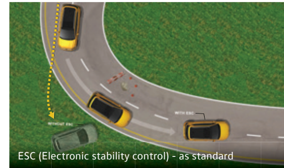
ESC (Electronic stability control) - as standard