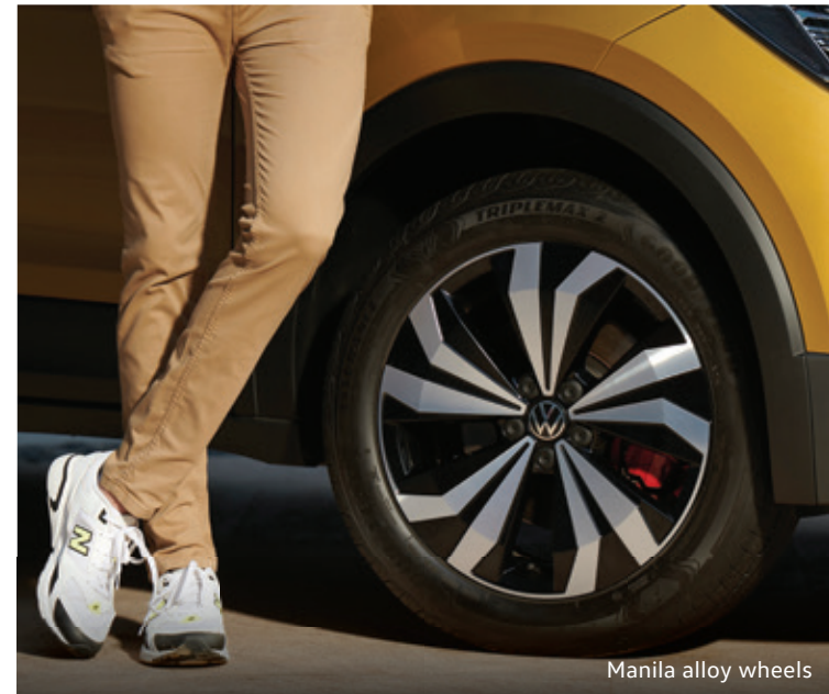
Manila alloy wheels