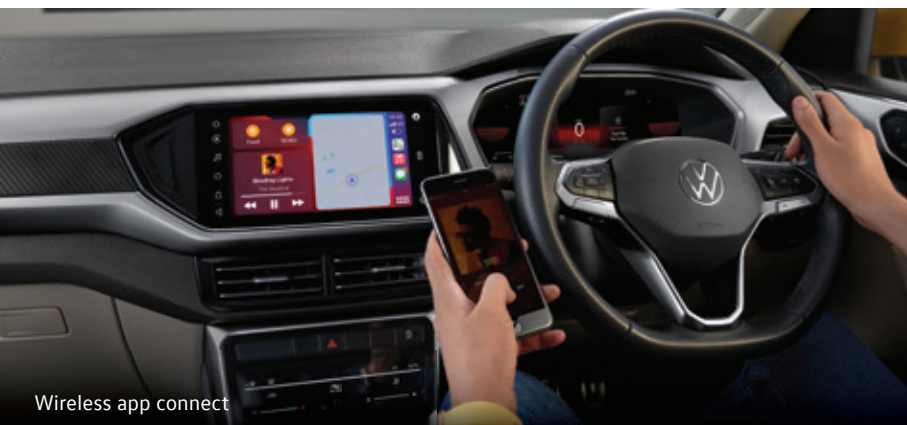
Wireless app connect