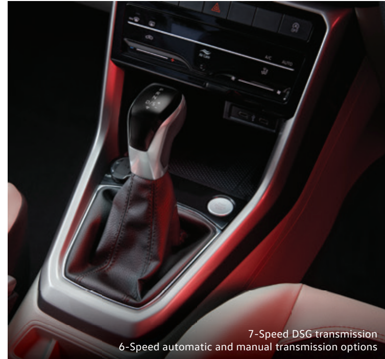
7-Speed DSG transmission 6-Speed automatic and manual transmission options

The thrill of hustle is in the chase of perfection. With the revolutionary TSI engine at its heart, the Taigun brings to the race, unabashed power combined with thoughtful efficiency. The 1.0L TSI engine available with manual and automatic transmission options, and the 1.5L TSI EVO engine that comes with manual and DSG transmission options, lets you pick the best combination to set the pace for every chase. The Manila alloy wheels provide that edge to complement the Taigun's performance.