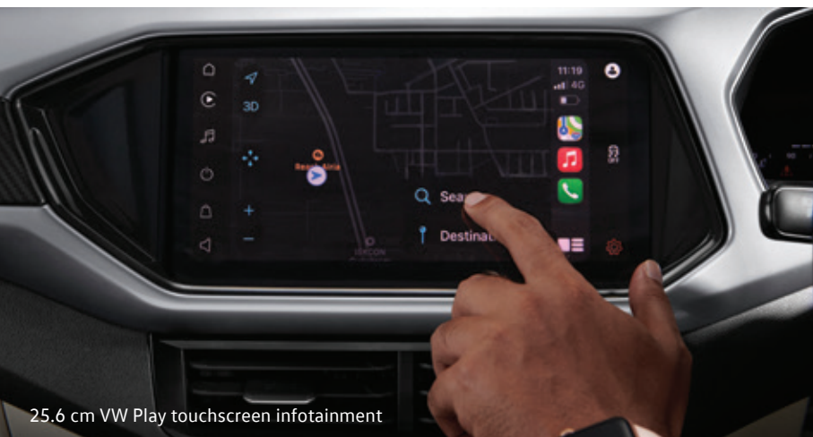
25.6 cm VW Play touchscreen infotainment

When it comes to technology, the Taigun is one step ahead. With the largest-in-segment* 20.32 cm digital cockpit, the Taigun always gives you an insight about your driving style. While the 25.6 cm VW Play touchscreen infotainment ensures that you stay connected to the hustle.