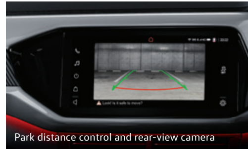
Park distance control and rear-view camera